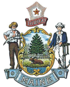
Maine Fire Protection Services Commission