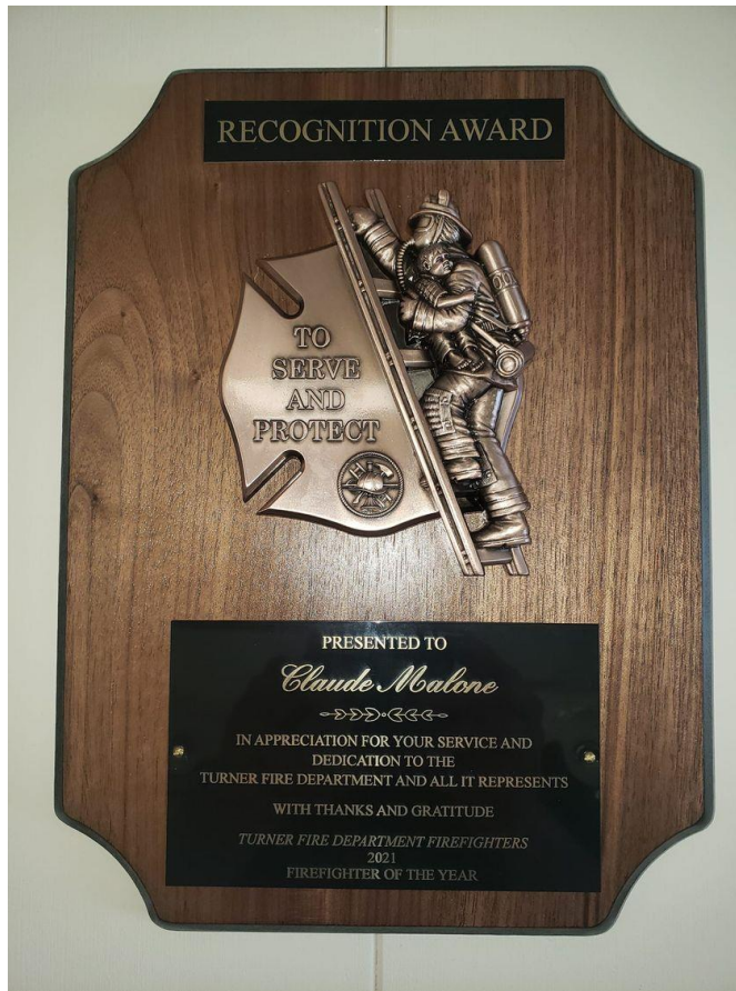
Turner Fire Department 2021 Firefighter of the year.