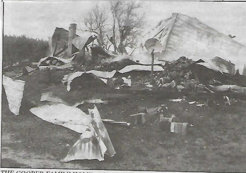
THE COOPER FAMILY HOME and a garage housing the Down East Blueberry Coop in Cooper were destroyed by a fire on September 28.