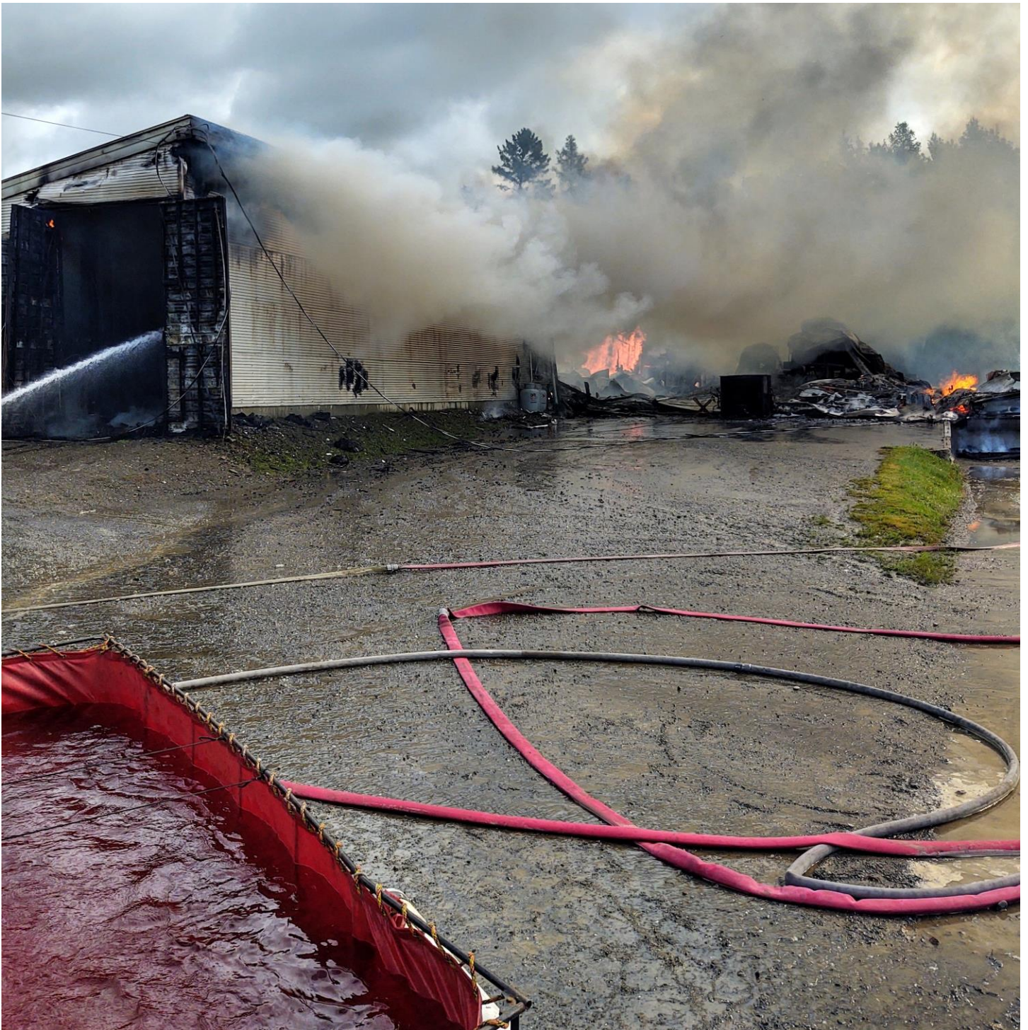
Fort Fairfield at potato house storage facility along with several other area departments at the end of August 2021