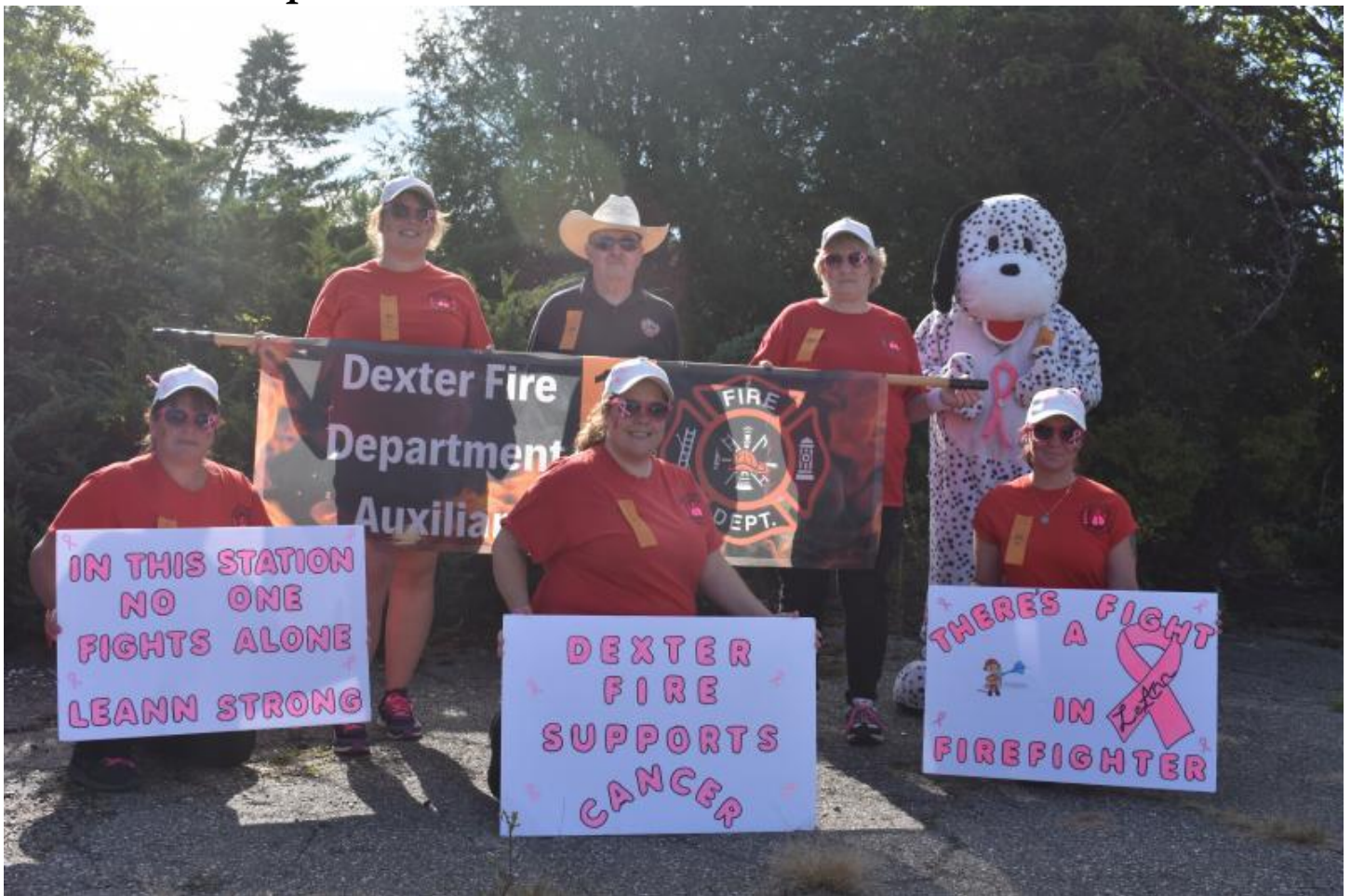
Dexter Fire Department ladies Auxiliary marches in the annual Federation parade for one of their own, with the Dexter Firefighters along the parade line cheering them on.