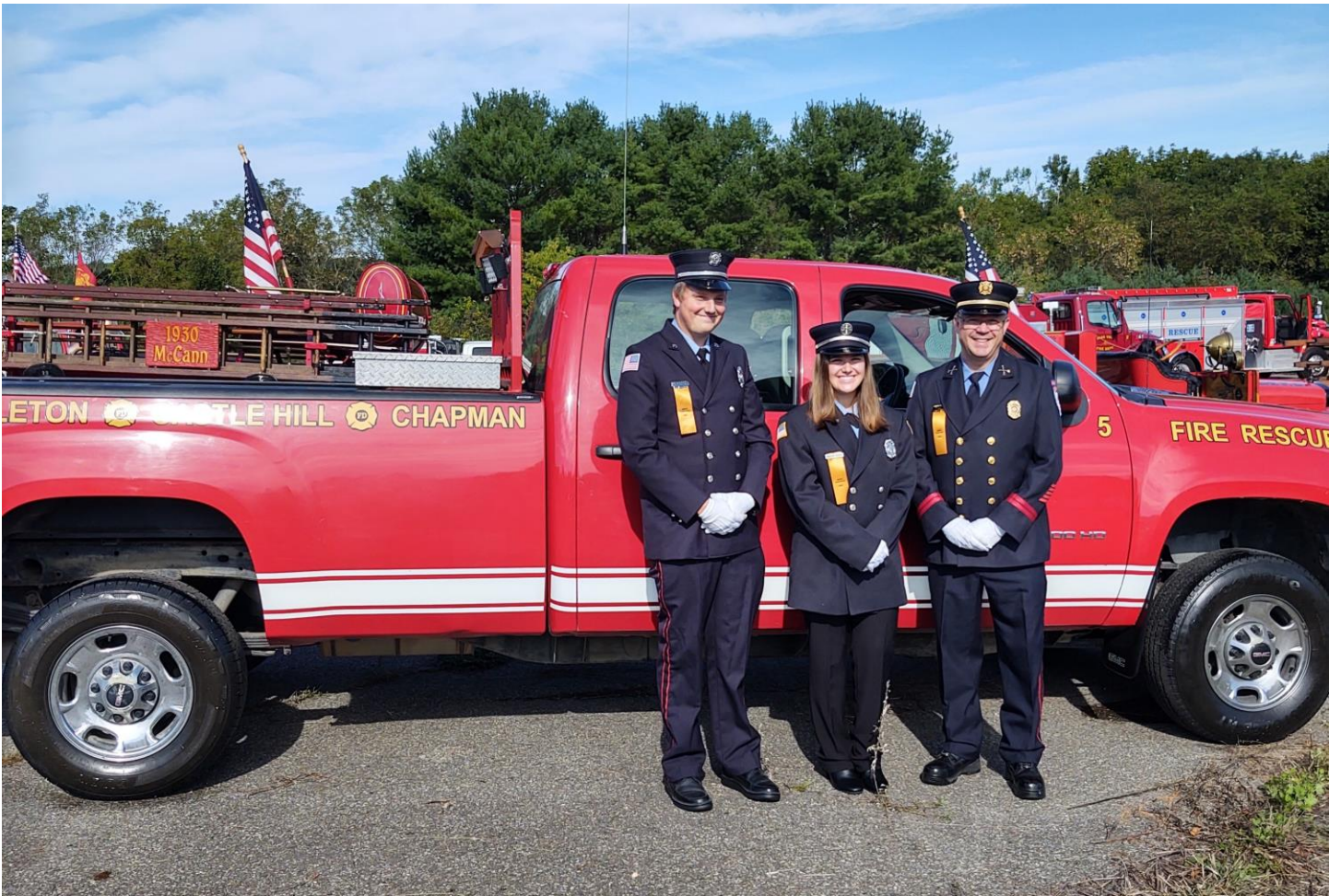
Members from the Mapleton, Chapman, and Castle Hill fire department at the convention in Waldoboro this past September 2021.