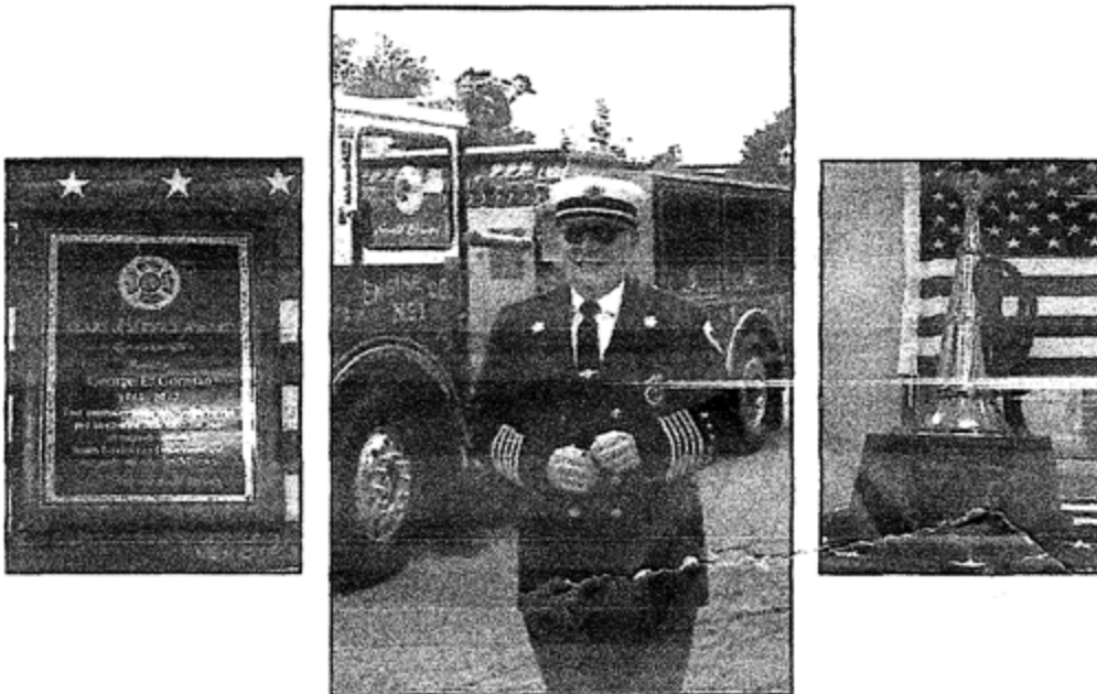
Left: Retirement Plaque